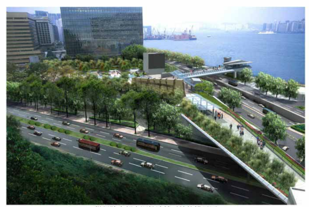
從訊號山望向運輸連接系統的構思圖 VIEW OF TRANSPORT LINK FROM SIGNAL HILL (ARTIST'S IMPRESSION)

74TI 尖沙咀東部的運輸連接系統 TRANSPORT LINK IN TSIM SHA TSUI EAST