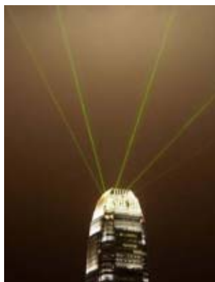
Lasers: produce powerful light beams