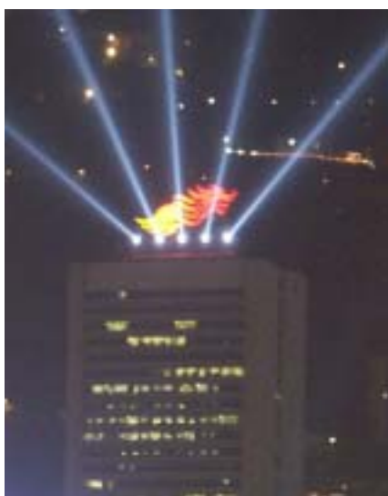
Search Lights: change intensity and project at different directions