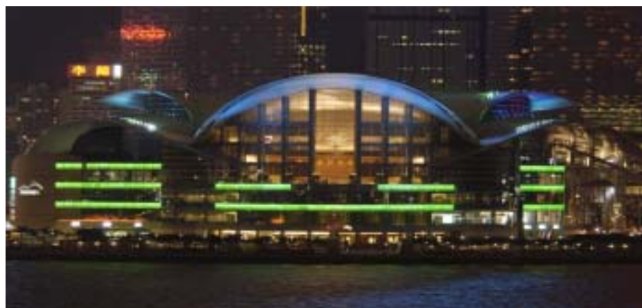
Light Emitting Diode Lights: display a varied range of colours at different intervals