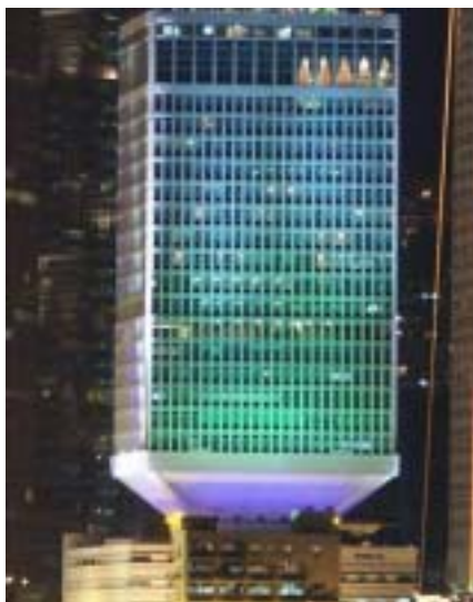
Flood Lights: add colour to the building's facade