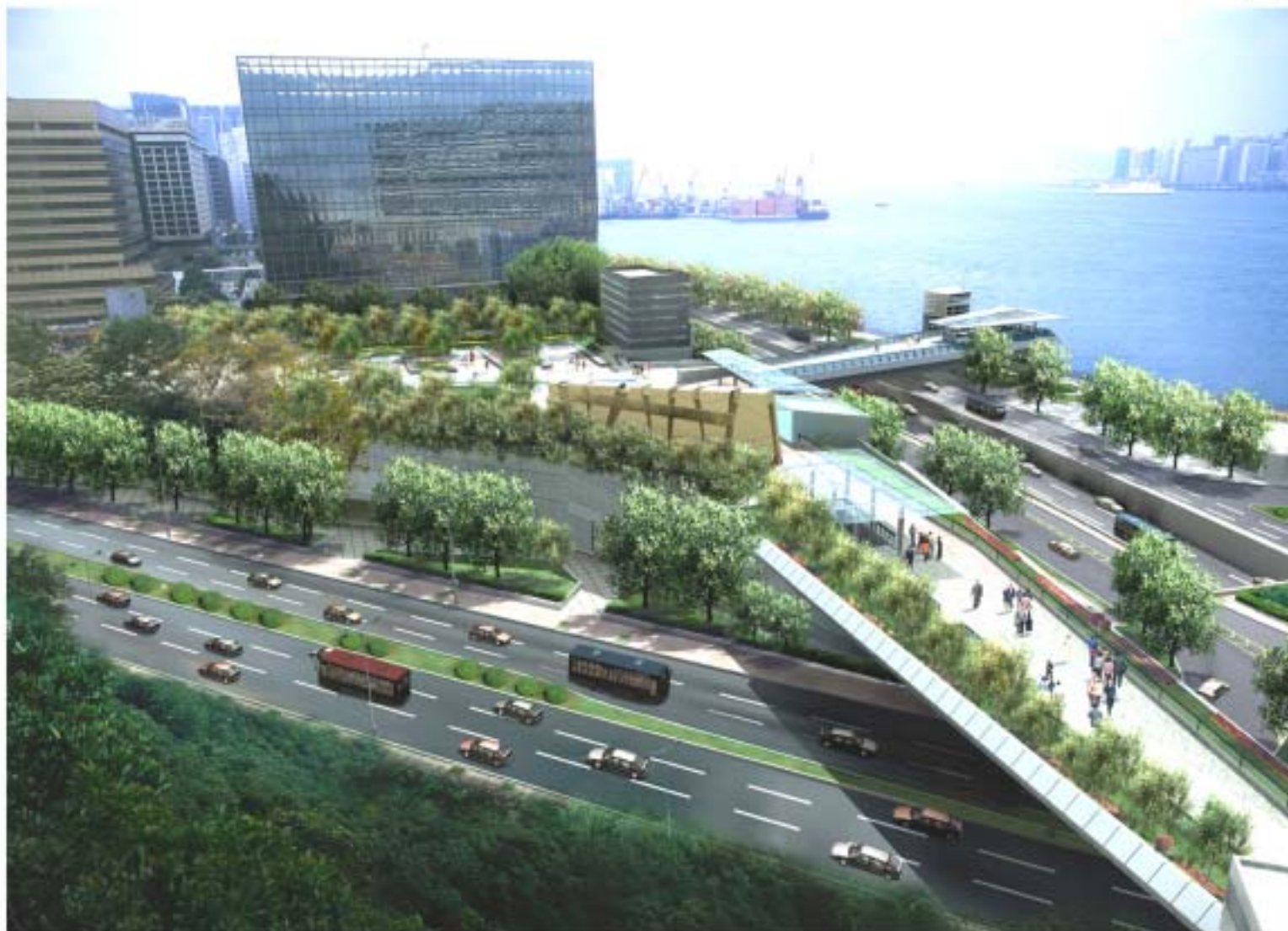
從訊號山望向運輸連接系統的構思圖 VIEW OF TRANSPORT LINK FROM SIGNAL HILL (ARTIST'S IMPRESSION)

74TI 尖沙咀東部的運輸連接系統 TRANSPORT LINK IN TSIM SHA TSUI EAST