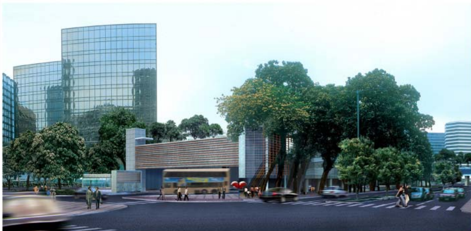
從漆咸道南與麼地道交界望向運輸連接系統的構思圖 VIEW OF TRANSPORT LINK FROM JUNCTION OF CHATHAM ROAD SOUTH / MODU ROAD (ARTIST'S IMPRESSION)

74TI 尖沙咀東部的運輸連接系統 TRANSPORT LINK IN TSIM SHA TSUI EAST