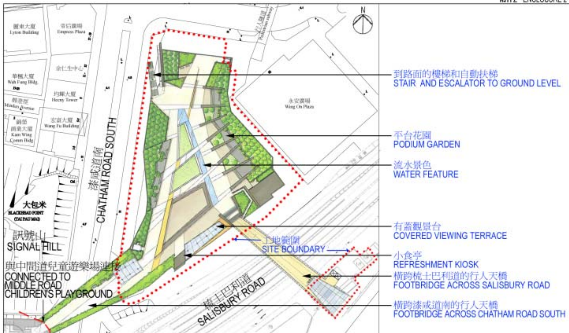
平台花園及行人天橋平面圖 PODIUM GARDEN AND FOOTBRIDGE LEVEL PLAN

74TI 尖沙咀東部的運輸連接系統 TRANSPORT LINK IN TSIM SHA TSUI EAST