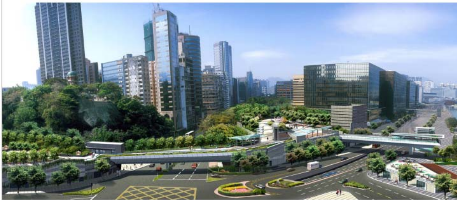
從南面望向運輸連接系統的構思圖 VIEW OF TRANSPORT LINK FROM SOUTHERN DIRECTION (ARTIST'S IMPRESSION)

74TI 尖沙咀東部的運輸連接系統 TRANSPORT LINK IN TSIM SHA TSUI EAST