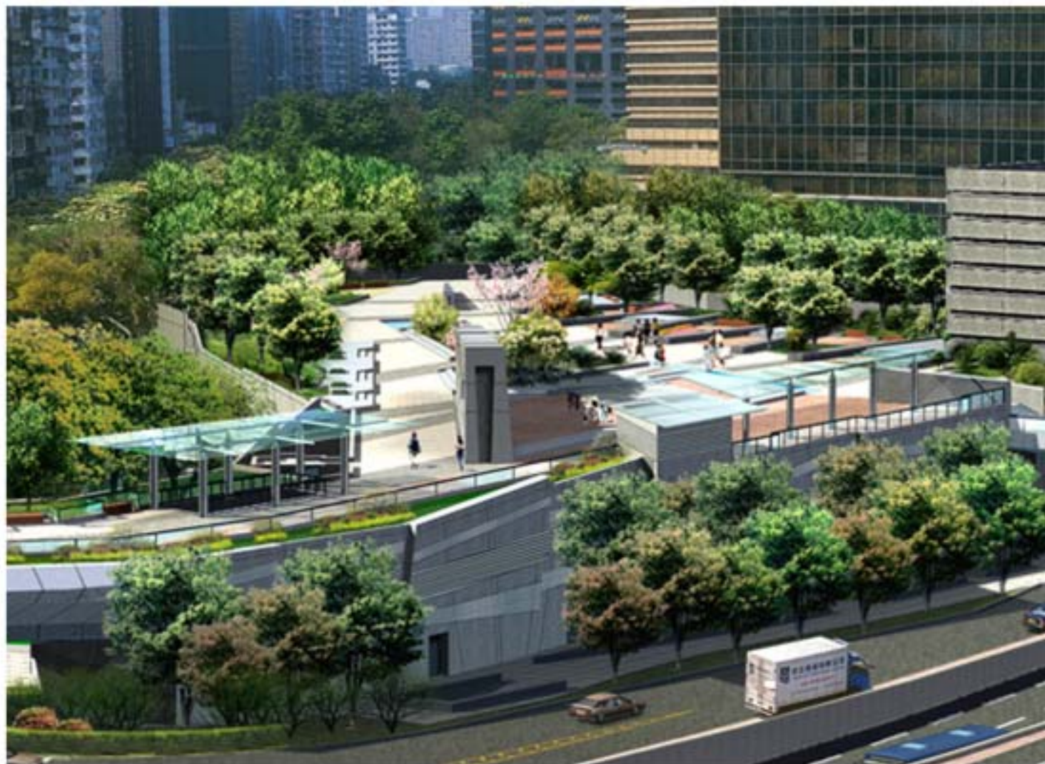
從南面望向花園平台的構思圖 VIEW OF PODIUM GARDEN FROM SOUTHERN DIRECTION (ARTIST'S IMPRESSION)