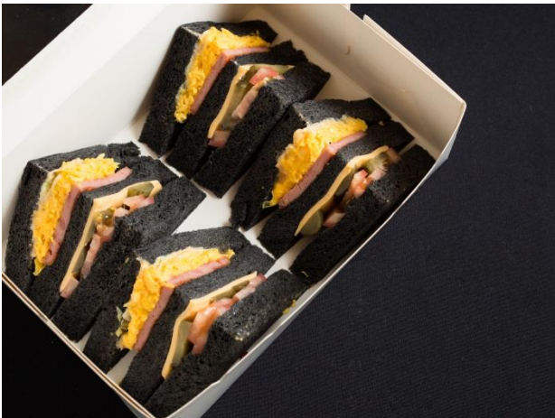
黑毛豬炒蛋竹炭三文治 (Bamboo charcoal sandwiches with Iberico ham and fried egg)

盟億有限公司 (華星冰室) Smooth Allied Limited (Christy Café)