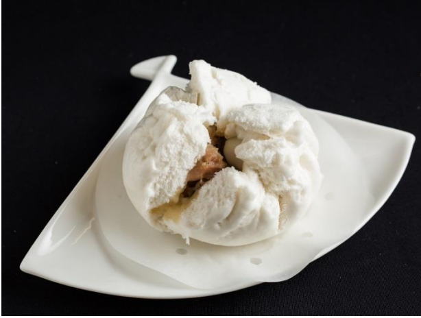
雞球大包 (Big chicken bun)