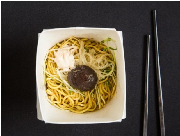
魔廚撈麵 Maureen Lo Mein