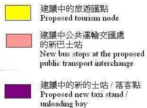
Location of Proposed Tourism Node